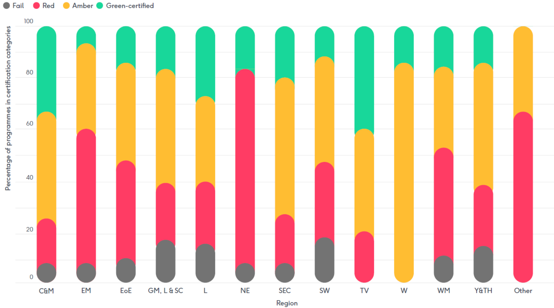
Fig. 4a. England